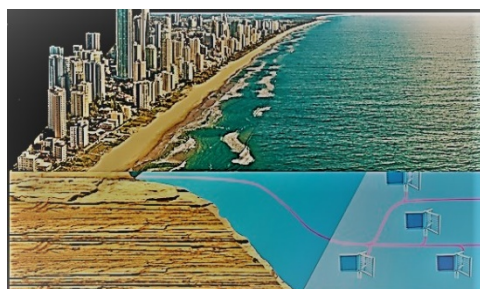
Fig 1.3 shows the setup of the underwater Turbine